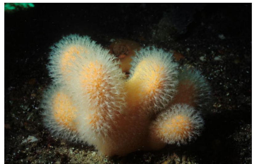
Figure 5. Dead man's fingers

In Marine Biology, we also found cases in which one language draws on metaphor and the other one draws on metaphor and metonymy at the same time. For instance, the species Alcyonium digitatum (a colonial soft coral) is called "deadman's fingers" in English because it forms thick, fleshy masses which are finger-like in appearance (see Figure 5). Thus, this is a clear case of metaphor grounded in shape. In contrast, this coral is called mano de muerto ('deadman's hand') in Spanish, which is both a case of shape-based metaphor and a case of metonymy in which the WHOLE (the hand) standing for the PART (the fingers) is used to designate a sea creature.