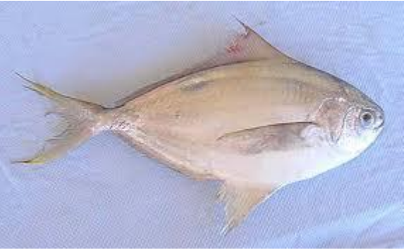
Figure 7. Butterfish

It can also be the case that cultural elements that are exclusive of one expert community shape the metaphorical conceptualisation of a sea organism in this community and in others. In our case, this means that one culture critically influences the other so that both use the same conceptual metaphor. Specifically, there is total coincidence of both cultures at the conceptual and the linguistic levels.