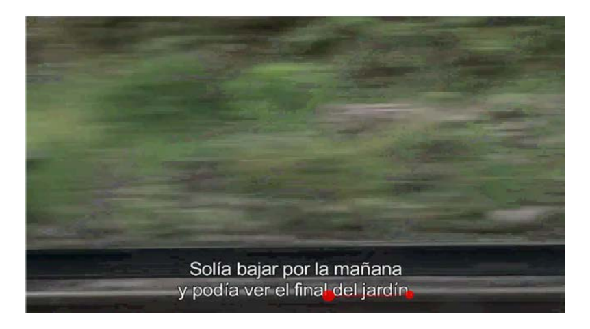
Figure 3. Transition shot with fixations from the eye-tracking study: view from train window.

Although most of these transition shots alleviated the subtitling load and provided gaps for AD, some were still covered by Trevor's narration. This is likely to have an effect on the reception of the film, as shown by anecdotal evidence gathered in an eye-tracking test conducted at the University of Roehampton with 10 native-English viewers of the original film and 10 native-Spanish viewers of the version with Spanish subtitles. While 8 out of 10 viewers of the original film were able to recall both the images and the content of the narration in these transition shots, none of the Spanish viewers remembered the images, most likely because their eyes (the red dots in the following screenshot) were fixed on the subtitles: