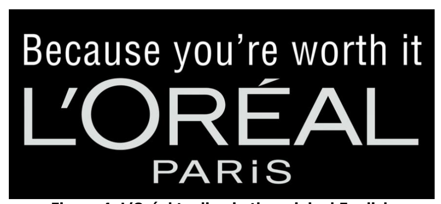
Figure 4. L'Oréal tagline in the original English

In 1973, the French cosmetics company L'Oréal wanted to enter the US hair colour market, so it commissioned an English tagline from the US advertising agency McCann.