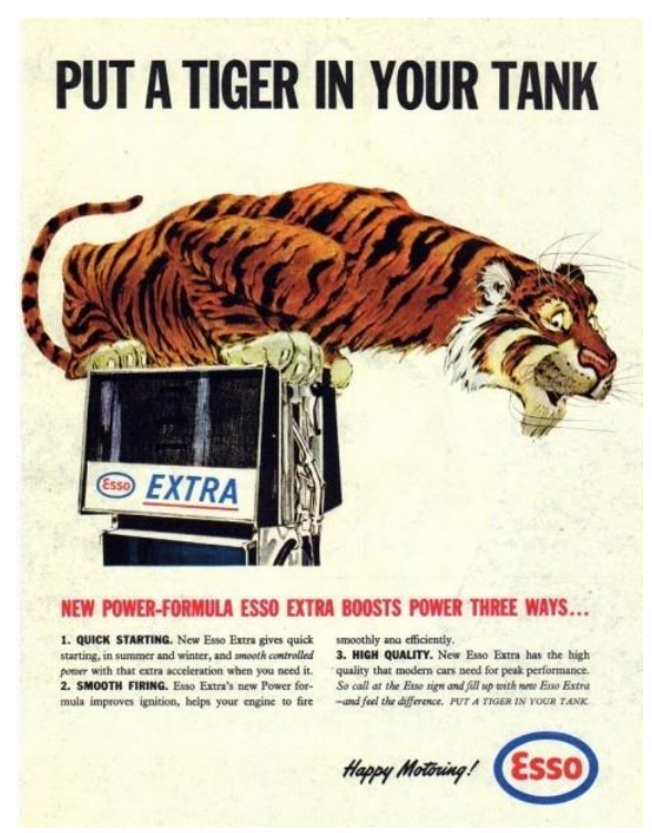
Figure 8. Esso print ad in the original English.

In "Put a tiger in your tank", the alliteration of the "T" and the "R" sounds recalls the roaring of both the engine and the tiger. This strapline has a certain rhythm and musicality that are part and parcel of the advertising message. The idea is that when you choose Esso fuels, you give your car an extra boost, as if you had a tiger in your tank. The Italian version conveys the same idea.