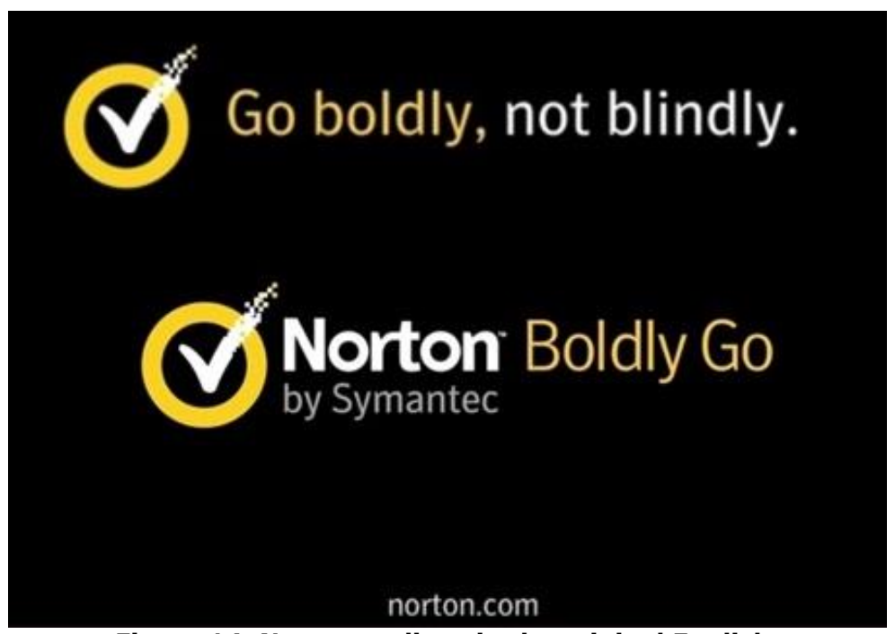
Figure 14. Norton taglines in the original English.

The third example comes from my own professional experience. In 2014, I adapted Norton<sup>™</sup> AntiVirus software's taglines (short and long versions) from English into Italian.