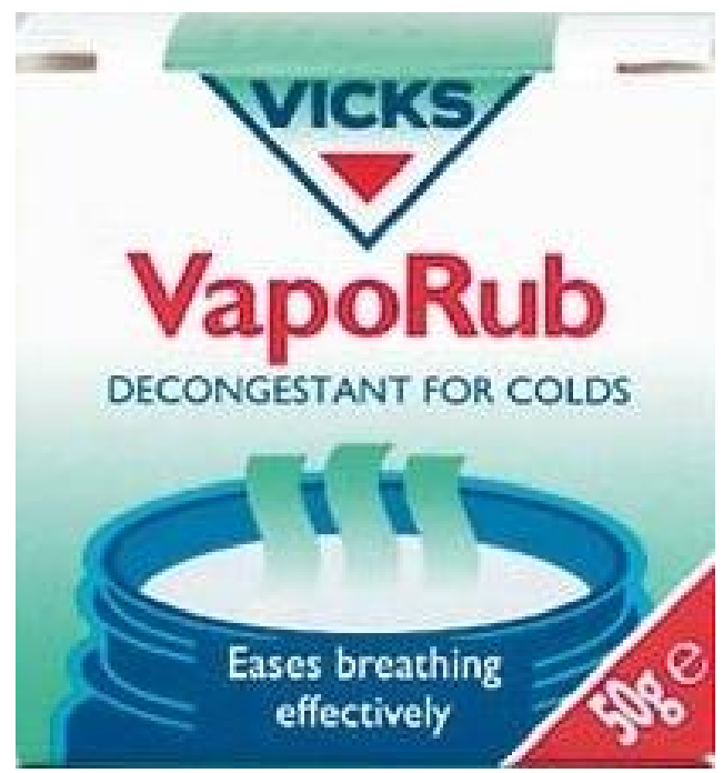
Figure 10. Vicks VapoRub packaging in the original English.

This hilarious case has to do with the negative connotations of a brand name. Below is the English-language packaging for Vicks VapoRub, a mentholated topical cream manufactured by American multinational P&G.