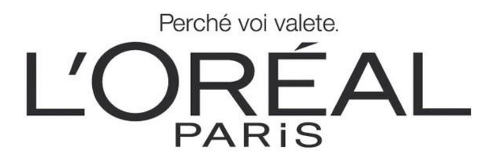
Figure 5. L'Oréal tagline in Italian.

This figure features the tagline in the second person plural ('voi'), although a version in the second person singular ("Perché tu vali") has also been used. The use of 'voi' instead of 'tu' may result in a slightly different nuance, as if the tagline were addressing women as a whole rather than a single woman reading the ad. However, what is particularly interesting here is the syntax. Although identical to the English original, it is not the kind of syntax a translator would normally use: having a causal proposition without a main clause is regarded as an infringement of grammar rules, which a professional reviewer would sanction. Within the context of advertising copy (and of transcreation), i.e. of persuasive texts that need to elicit an emotion in the target audience, it is perfectly acceptable instead.