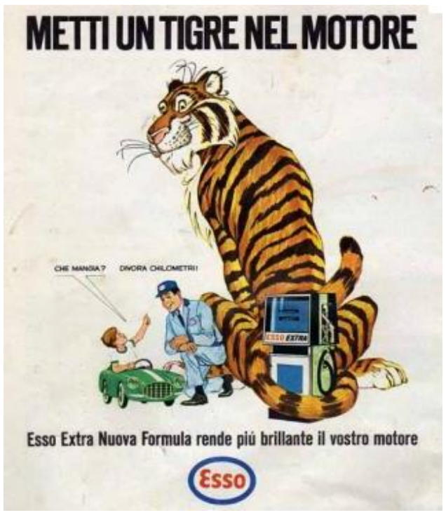
Figure 9. Esso print ad in Italian.

In "Put a tiger in your tank", the alliteration of the "T" and the "R" sounds recalls the roaring of both the engine and the tiger. This strapline has a certain rhythm and musicality that are part and parcel of the advertising message. The idea is that when you choose Esso fuels, you give your car an extra boost, as if you had a tiger in your tank. The Italian version conveys the same idea.