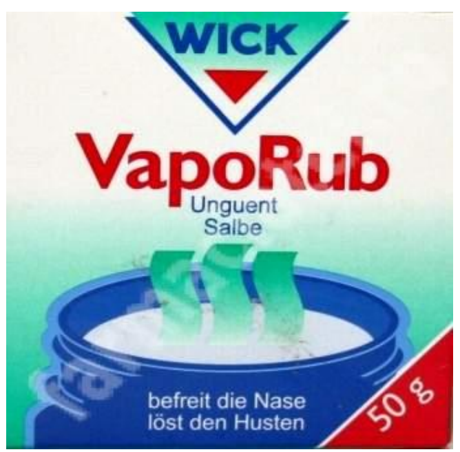
Figure 11. Vicks VapoRub packaging for German-speaking countries.

It was only upon learning that the product wouldn't sell in German-speaking markets – rumour has it – that P&G decided to tweak the brand name for those countries. A change of a consonant, the deletion of the final 'S,' and sales began soaring.