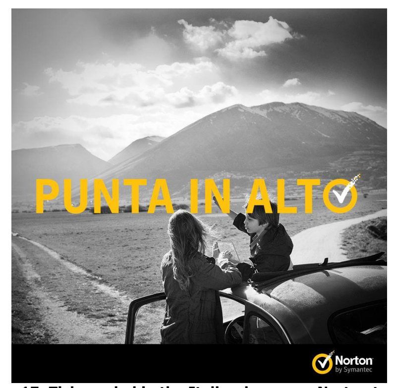
Figure 17. Tick symbol in the Italian-language Norton tagline.