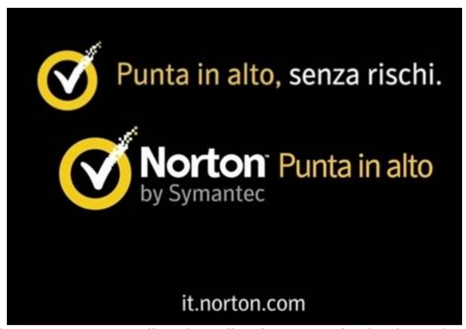
Figure 16. Norton taglines in Italian (transcreation by the author).