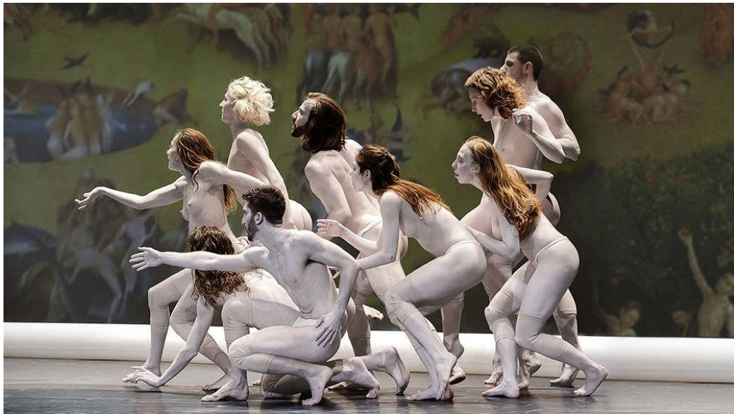
Figure 3: “Humankind before the Flood”, part of Chouinard’s Jérôme Bosch: Le Jardin des Délices (2016).

eyes with a multitude of mingling white bodies that populate its foreground, a closer look will reveal two black men standing at opposite ends (left and right), a black woman (middle left) and some black women bathing in the centre. Commentators of the painting have traditionally read these figures as representing danger, carnal temptation, sin, or even pointing to an “exotic and untamed counter-world” (Vanderbroeck, in Fischer 2016: 162). Hence, if Bosch – or, better, his institutionalised reception – relegates the black bodies to the role of savages and sinners, Chouinard takes this line of thought to its extreme and simply erases them from among humankind while at the same time pointing to this act of erasure and of homogenisation through the striking view of the unnaturally white bodies, standing out starkly against the colourful background provided by the painting.