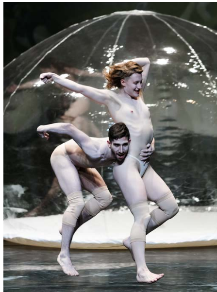
Figure 2. "Humankind before the Flood", part of Chouinard's Jérôme Bosch: Le Jardin des Délices (2016). Photography by Nicolas Ruel, courtesy of the artist.

of order and joy, passing through a phase of chaos and horror and coming back to light and to an even better order of things.