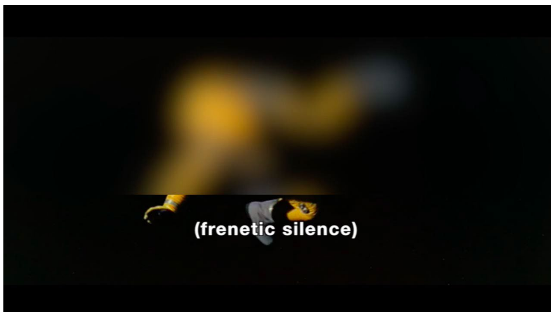
Figure 4. First non-standard sound description provided by deaf users for Close Readings .