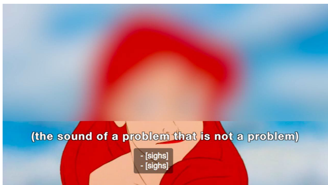
Figure 6. Third non-standard sound description provided by deaf users for Close Readings .

By blurring the images, Sun Kim challenges the semiotic hierarchy of MA, giving prominence to the normally marginalised captions, which here, as produced by deaf users, range from literal to conceptual, imagined or even poetic. They are anything but homogeneous; in other words, they are a true reflection of the heterogeneity of the viewers.