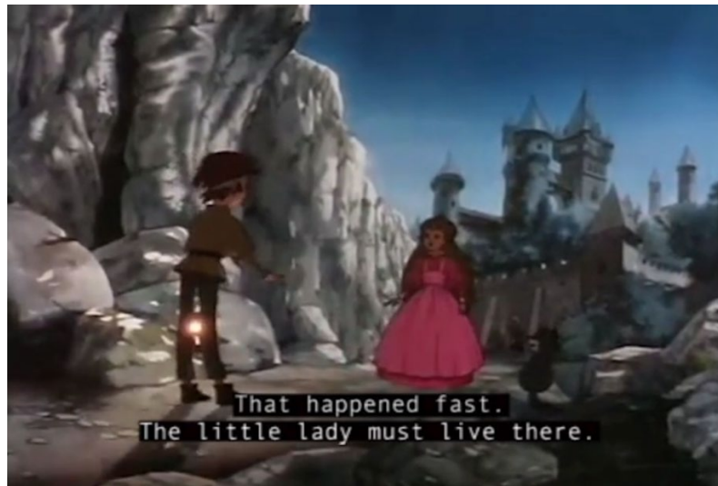
Figure 1. Sylvestre's interpretation of the plot.

but to provide her own personal account of exclusion from audiovisual media and from society. The captions include Sylvestre's interpretation of what is happening on screen as a result of not having access to the dialogue (Figure 1), descriptions of the images (Figure 2) and a wider commentary on what it is like to be excluded from sound in society (Figure 3).