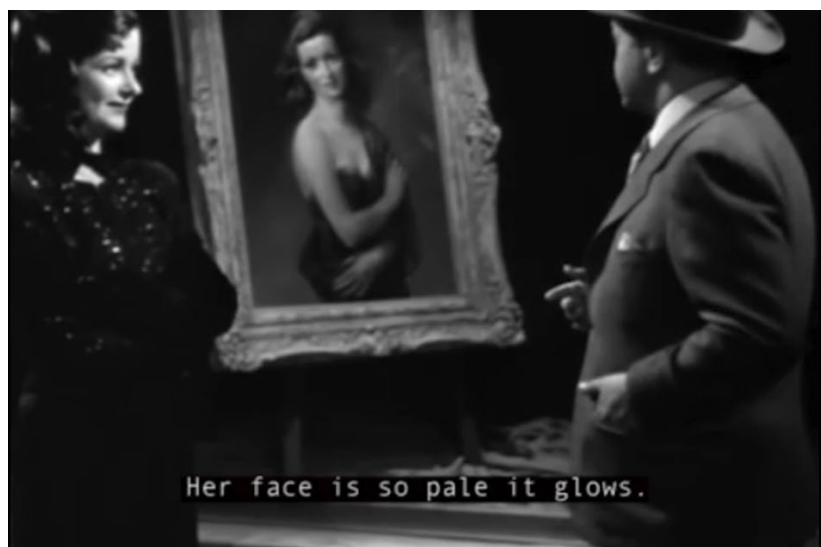
Figure 2. Sylvestre's descriptions of the images.