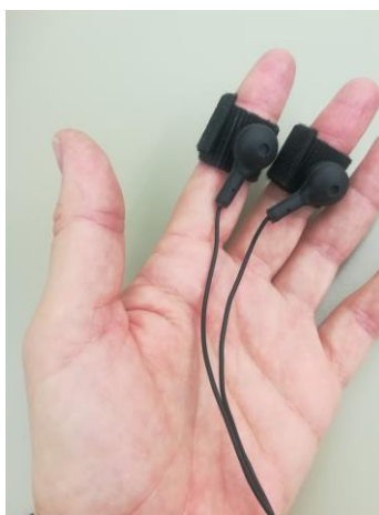
Figure 1. Recommended placement of the EDA electrodes

The location on the skin to which the electrode is attached should not be cleaned with alcohol or abrasive substances ( ibid. ). Since moisture facilitates the flow of the electric current, humidification with a saline solution is advised. During the experiment, the subject should be relaxed and keep as still as possible since any movement will be registered and affect the recordings. Two key elements to consider when configuring the EDA record are the gain and the acquisition frequency. The latter can be defined as the number of samples recorded per second and it is considered adequate between 20 and 30 Hz (Boucsein et al. 2012). Gain measures the increase in power or amplitude of a signal and it is recommended that a signal gain of between 5 and 10 micromhos / cm is established (Braithwaite et al. 2015). These parameters are automatically set up by the system.